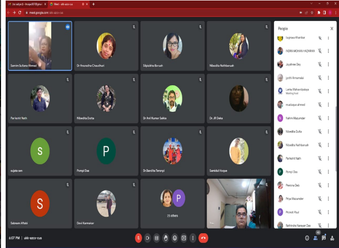
Webinar on "Women in 21st Century: Challenges and Prospect"