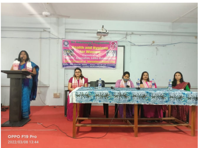
Program on Health & Hygiene for Women, organized by Students Association, Lanka Mahavidyalaya, Lanka, Assam on 8-3-2022