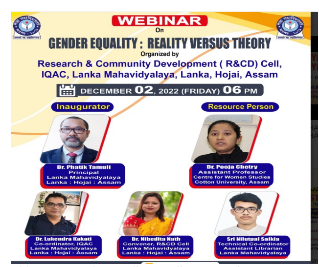
Webinar on : Gender Equality : Reality versus Theory On 02/12/2022