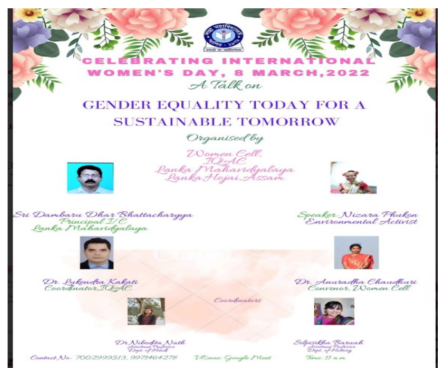
Gender Equality for a Sustainable Tomorrow on 8/3/2022 Organized by Women Cell, IQAC, Lanka Mahavidyalaya