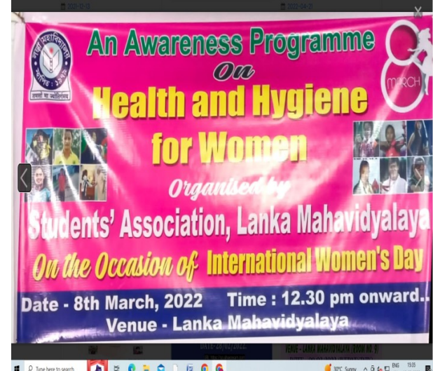
Awareness Program on Health & Hygiene for Women, Organised by Students Association, 8/3/2022